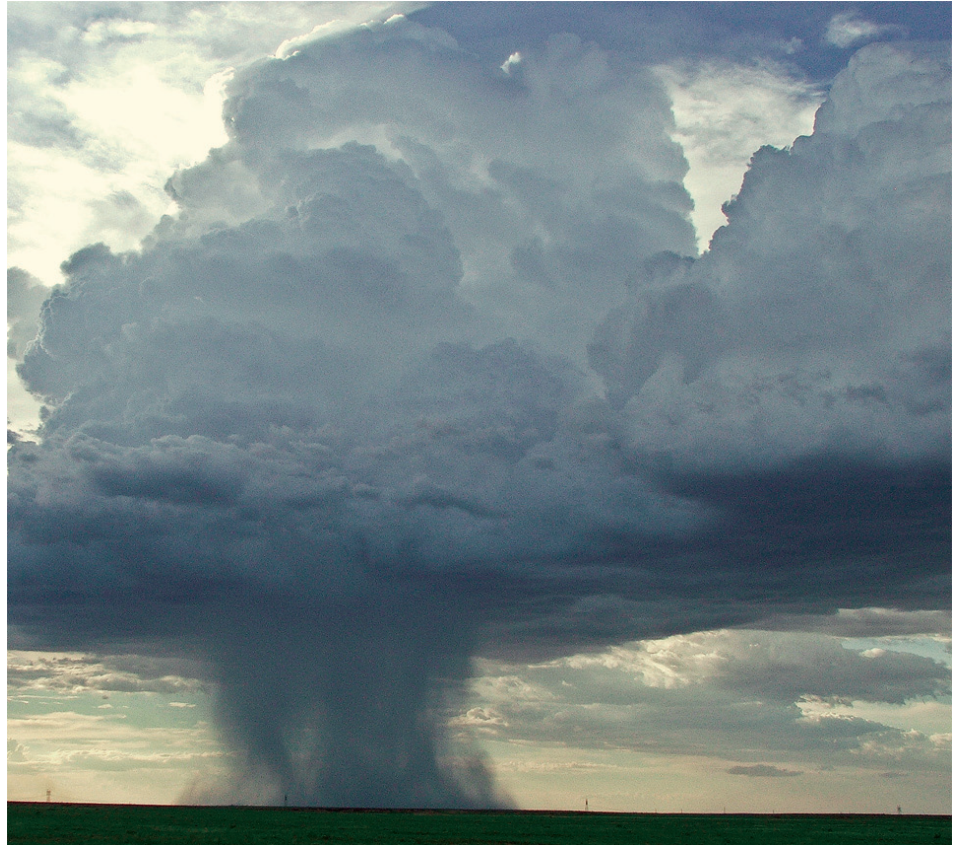
Figure 1. Monsoon rains are a welcome guest in the Southwest, helping to suppress scorching temperatures and delivering nearly half of the yearly rainfall for parts of southern Arizona and New Mexico.