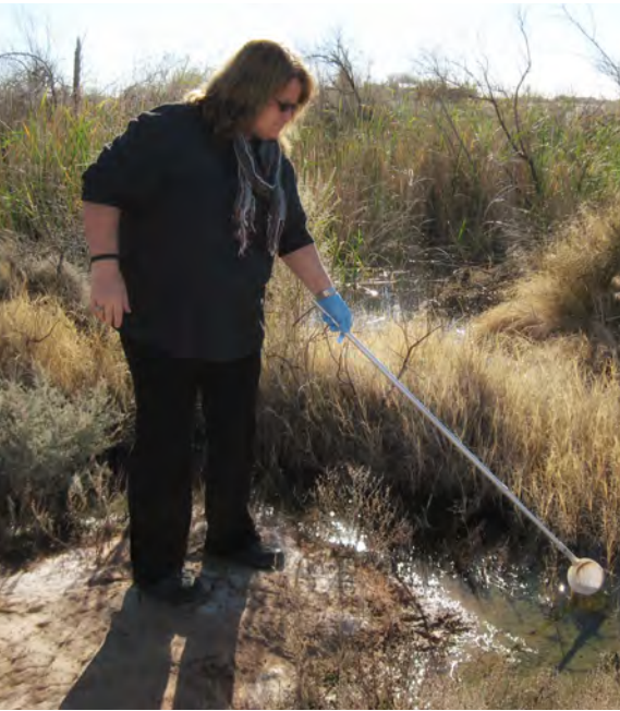
Pinal County Vector Control Program staff monitoring mosquito breeding

Changes in climate will affect the distribution of vector-borne diseases in Arizona through effects on mosquito and other vector populations. West Nile virus (WNV), a mosquito-borne arbovirus, is likely to be impacted by temperature and precipitation changes with a lengthening (earlier start and later end) to the mosquito season in Arizona. Vector control at the Pinal County Public Health Services District (PCPHSD) often rely on experience to initiate the start and end of their vector control seasons including spraying and messaging campaigns to reduce mosquito habitats. However, recognizing that experience is becoming increasingly less reliable as the baselines shift, there is a need for deciding when to initiate and end the vector control season and when to send public health alerts to the community.