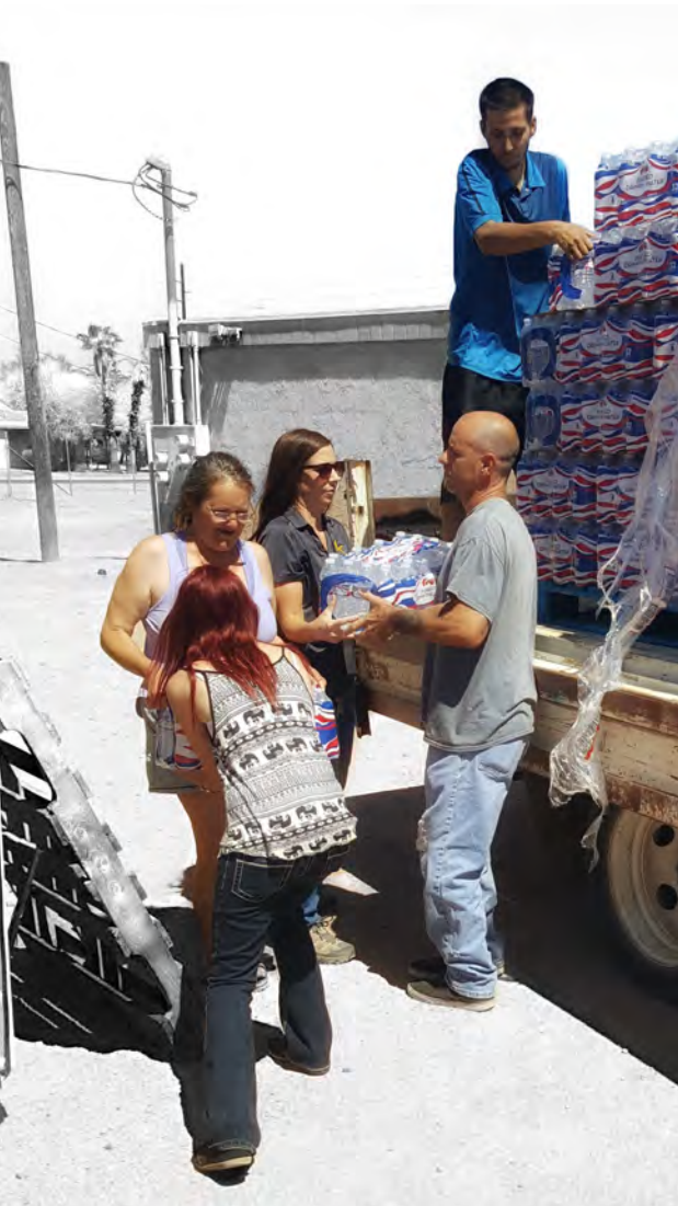
Pinal County Heat Relief Network volunteers loading water for distribution to hydration stations

PCPHSD plans to utilize baseline HRI data, and summer 2018 interview data to better understand HRI risk factors and risk populations. Following the completion of summer 2018 data analyses, PCPHSD plans to develop interventions and increase collaborations with key stakeholders. One intervention that was initiated is the Pinal County Heat Relief Network (HRN). The HRN is a collaborative effort between PCPHSD, United Way of Pinal County, and Central Arizona Governments. The key goal of the HRN is to provide heat relief to Pinal residents through four types of relief stations: hydration, daily heat relief, emergency heat relief, and water drop-off/storage. PCPHSD hopes HRI illness and death data can be used to improve the HRN by developing new partnerships and installing new heat relief stations in areas with high HRI. PCPHSD also hopes to improve HRI education and prevention efforts among Pinal County residents, employers, and schools.