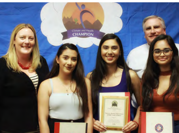
Trevor G. Browne High School Students accepting Climate and Health Champion Youth Category Award from Maricopa County Department of Public Health