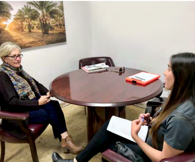
Arizona Department of Health Services Staff conducting interview with a Yuma County Cooling Center Facility Manager

In November 2018, the project team returned to Yuma and conducted open-ended interviews with managers of five sites that acted as a cooling center or water site during the summer of 2018. The team learned that most of the sites that participate as cooling centers or water sites are non-profit organizations, which rely heavily on donations and volunteers for their operations. As a result, these locations have a widely varying amount of available resources to support heat relief and water distribution. In addition to operating as a cooling center or water site, managers identified that users were often also looking for a facility that provided meals and entertainment. Facility managers also mentioned that they would like to offer cooling towels, reusable water bottles, hats, sunscreen, lip balm, and maps of cooling centers in both Spanish and English to cooling center and water site visitors.