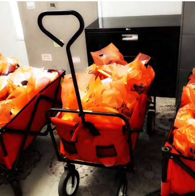
Heat relief supplies prepared by Yuma County Public Health Services District to distribute to heat vulnerable populations

In Yuma County, there were 139 heat-related deaths between 2003 and 2017. Furthermore, in 2017 alone, there were also 229 heat-related illness emergency department visits. Local public health and emergency management officials have identified access to air conditioned space as an important protective factor against heat-related illness and death for heat vulnerable populations, including individuals experiencing homelessness and senior residents who cannot keep their homes sufficiently cool.