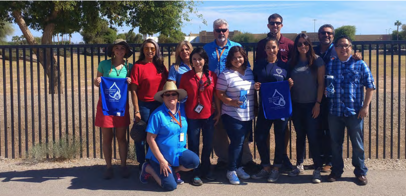
Team photo of volunteers from Yuma County Public Health Services District, Arizona State University, and the Arizona Department of Health Services.