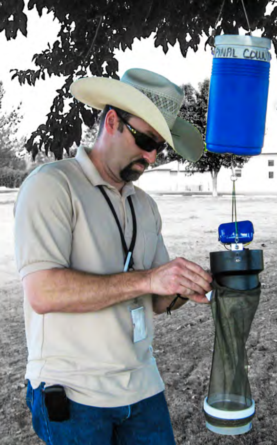
Pinal County Vector Control Program staff setting up a mosquito trap for monitoring