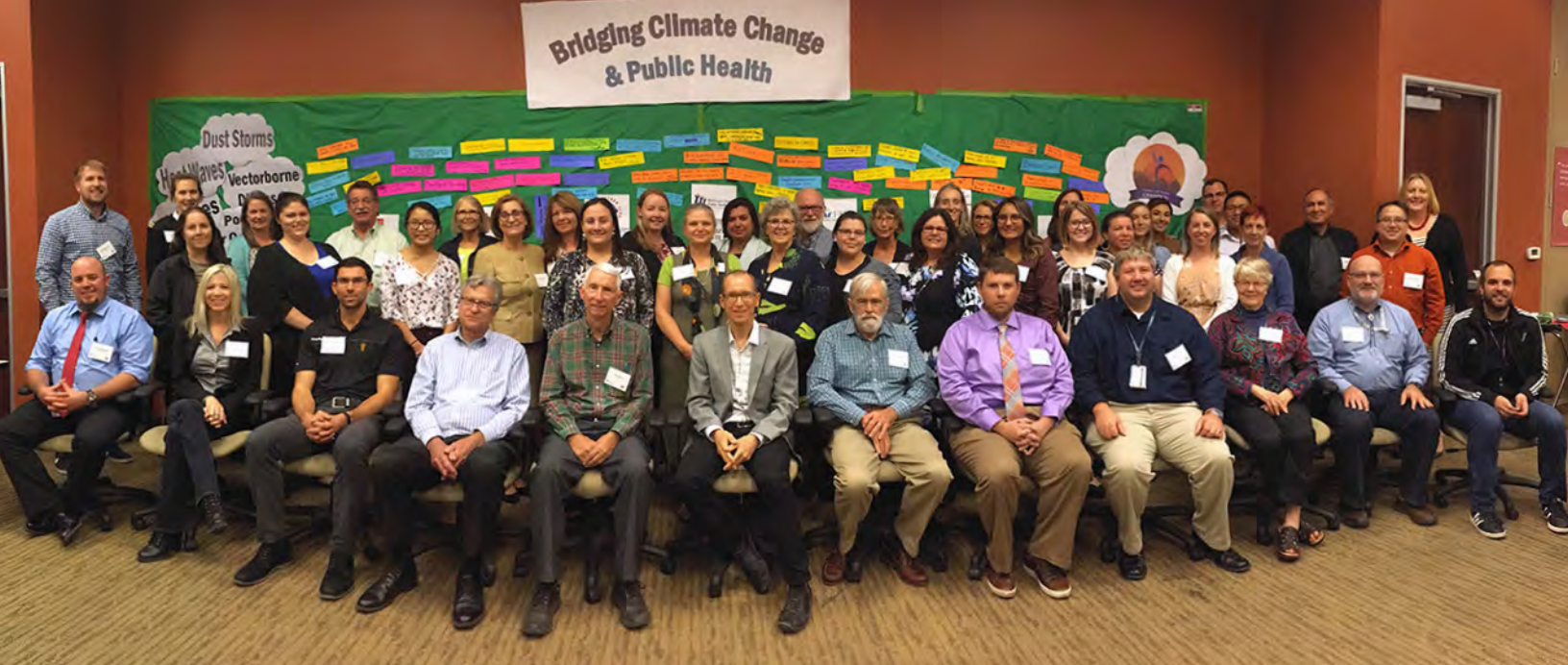
Meeting Attendees at the Maricopa Department of Public Health Bridging Climate Change and Public Health Meeting (November 9, 2018)