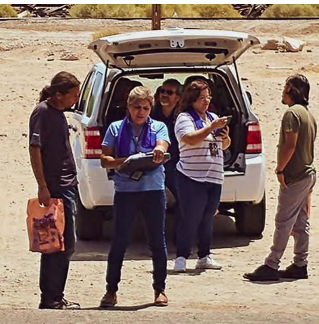
Yuma County Public Health Services District Staff distributing heat safety outreach materials and conducting interviews for improving heat response efforts with residents

The project team offered water bottles, cooling towels, and heat safety education materials to everyone they approached and successfully administered 76 complete surveys across six different locations in Yuma. A majority of respondents (71%) said that they did not have a regular home on the survey date. Less than half of respondents knew what a cooling center was (46%) or were able to identify where cooling centers were located in Yuma County (40%). Of those familiar with the cooling centers, respondents most commonly reporting learning about their location through word of mouth and from local organizations. Only 41% of respondents felt that their health was in danger on hot days despite 60% of respondents reporting experiencing medical symptoms related to heat. Approximately two thirds of respondents did recall hearing about heat warnings during the summer of 2017 and 79% of those who remembered receiving the warning reported changing their behavior as a result. Respondents who reported changing their behaviors in response to heat warning messages often cited drinking fluids and avoiding the outdoors as their most common protective actions.